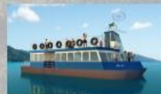
Catamaran Cruise Double Decker